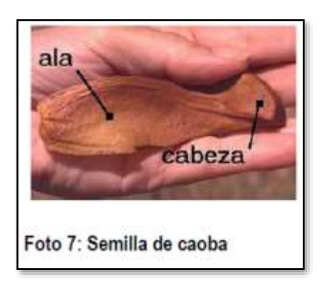
Seed of Caoba