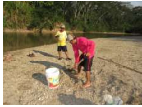
Preparation vertex placement 3

On December 1, 2015, the borderline was made at the Puerto Nuevo NPP in vulnerable areas, with the presence of its neighbor, the Puerto Azul NPP, were placed milestones 3 and 5, coordinates V3 (0462124E, 8974733N) and V5 (0452002E, 8988588N) respectively.